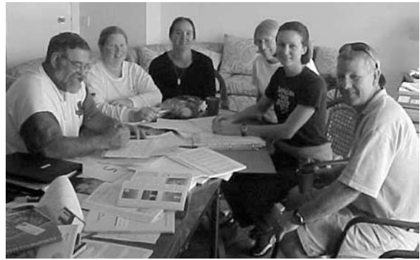
MTAQ Junior marine studies meeting Aug 2002 Hervey Bay