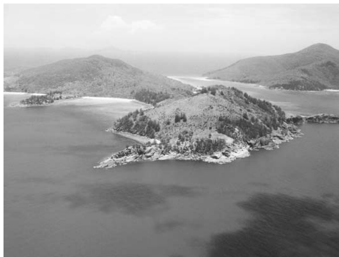
Whitsunday Islands - Conference Field Trip Sites July 2003