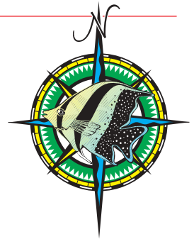
Marine Teachers Association of Queensland Inc

NOTE: FEES DO NOT INCLUDE TRANSPORT TO ISLAND OR FROM DUNWICH TO AMITY POINT