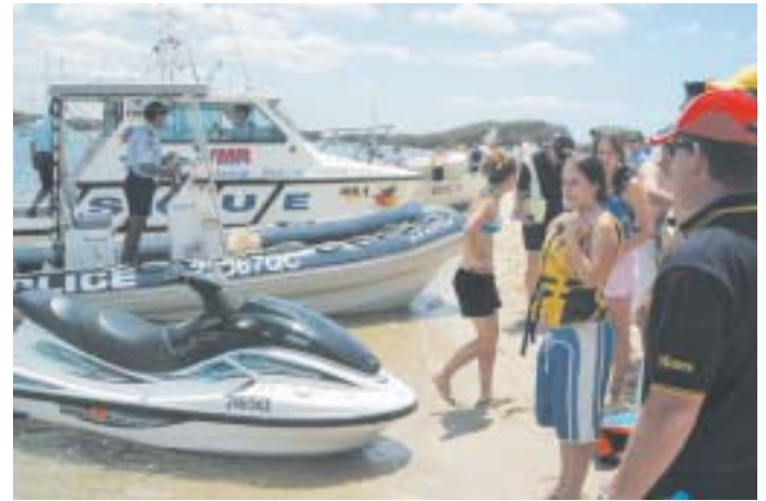
Some of the many organisations involved in the Gold Coast MOST day

The organisers would also like to thank Gold Coast City Council, Queensland Transport, Qld Boating and Fisheries Patrol, Water Police, Qld Fire and Rescue, Volunteer Marine Rescue, Northcliffe SLSC, Southport Fishing and Dive, BeeJay Boat Trailers, Nitro Marine, Whitworths Marine, Wild Marine, Wet Paper Publications, The Southport School and Marymount College.