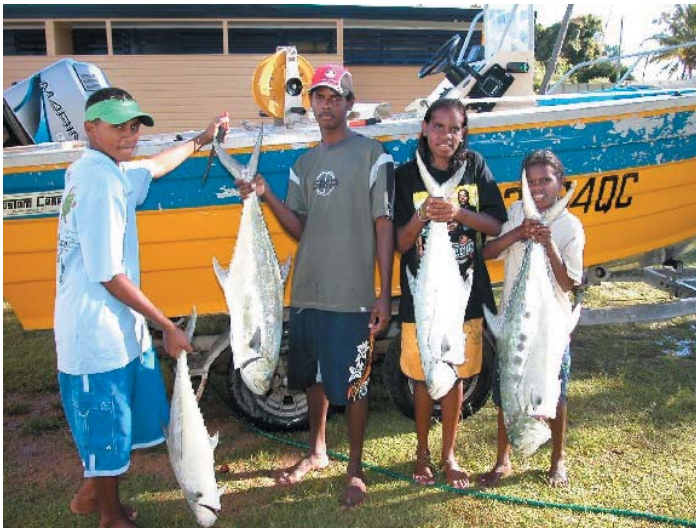
Here's a pic of the school's other boat.

The students are all Aboriginal Palm Islanders and show a keen interest to learn the finer details of fishing; trolling for pelagics using overhead combos, deck winches, handlines; bottom fishing for reef species; and casting popper lures across patches of reef for trevally and queenfish (as below).