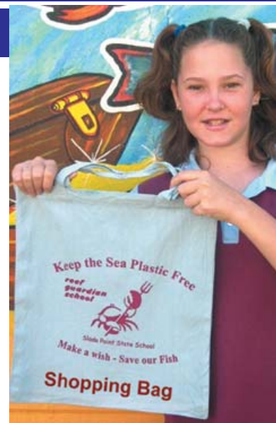
Junior Marine Studies students from the Reef Guardians Program will speak at conference